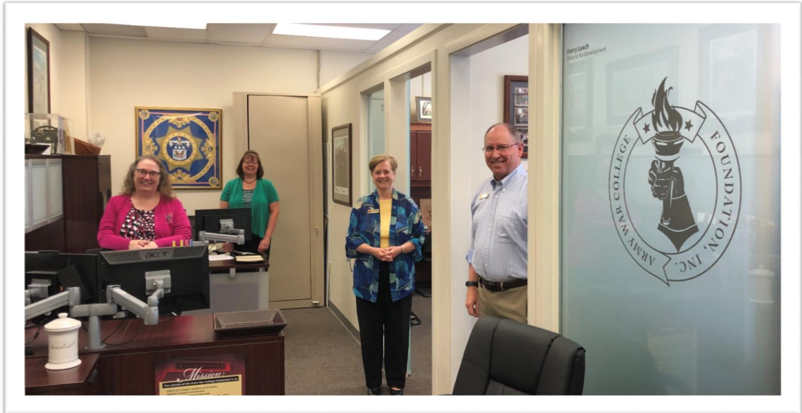
Our Main Office